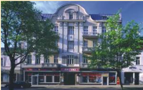
One of the houses in the Holy Virgin Mary Avenue

The Church of the Holy Virgin Mary (C/D-4) - built together with the convent of Mariavite Sisters in 1859 - 1862. The Neo-Gothic, one-nave interior without separate presbytery is covered with a panelled ceiling decorated with wooden rosettes. The walls are covered with Secession paintings of flowery motifs. The former convent church has become now the academic church. Pictures of famous painters are to be found here like: the picture of Immaculate Conception of the Blessed Virgin Mary by Rafał Hodziewicz; also paintings by January Suchodolski and Piotr Le Brin. On the wooden choir gallery there is an organ dating from 1935. Under the choir gallery there are two sandstone stoups with Baroque features.