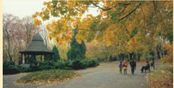
The Stanisław Staszic Park

St. Andrew and St. Barbara's Church (A/B-7) - built in the mid-17 th century for the novitiate of the Jasna Góra Monastery. The location of the Church was probably determined by the presence of the spring in which, according to the legend, the profaned picture of the Black Madonna, stolen from the Jasna Góra Monastery, was washed in 1430. At the end of the 19 th century the church became a parish church. The church itself was built in Baroque style with some traces of Gothic, originally with one nave, later extended by two side aisles into chapels. The tower is crowned with a Baroque dome. Behind the church there is St. Barbara's Chapel with the spring.