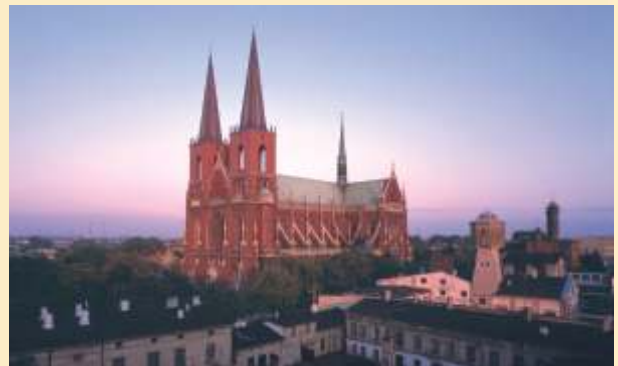
The Holy Family Cathedral

The Golden Mount (Złota Góra) - a limestone hill on the Eagles' Nests' Route facing Jasna Góra. On its white slopes the Mount reflects the rays of the sun over the City. From this place the panorama of Częstochowa can easily be seen. Limestone used to be a very popular building material in the past and many of the City buildings were constructed of stone excavated here. Today excavation pits went out of use but are still an attraction of paramount importance.