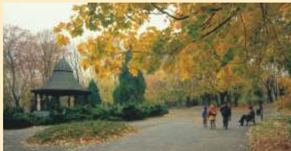
The Stanisław Staszic Park

St. Andrew and St. Barbara's Church (A/B-7) - built in the mid-17 th century for the novitiate of the Jasna Góra Monastery. The location of the Church was probably determined by the presence of the spring in which, according to the legend, the profaned picture of the Black Madonna, stolen from the Jasna Góra Monastery, was washed in 1430. At the end of the 19 th century the church became a parish church. The church itself was built in Baroque style with some traces of Gothic, originally with one nave, later extended by two side aisles into chapels. The tower is crowned with a Baroque dome. Behind the church there is St. Barbara's Chapel with the spring.