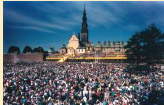
The Jasna Góra Monastery - view from the East

Then King John Casimir in his Lvov Vows declared the Mother of God to be the Queen of Poland. It happened that the fortifications of Jasna Góra withstood the sieges of the Swedish army during the Northern Wars in 1702, 1704 and 1705. After some time in the year 1717 the first coronation of the Black Madonna picture took place in Poland.